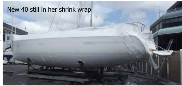
New 40 still in her shrink wrap

Like most years, November and December are always hectic as we face the challenge of commissioning our new arrivals. It's an exciting time for us as we watch the new boats emerge from their shrink wrap cocoons.